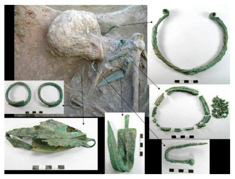
Figure 2: One of the burials with metal objects found in Resuloğlu (Yıldırım and Zimmermann, 2007)