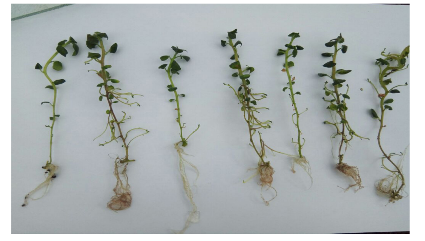
Figure 1. Plantlets of potato variety Desiree are ready to be transplanted in peat moss on the greenhouse tables.

The experiment was conducted using completely randomized design (CRD). The data were analyzed by Analysis of Variance (ANOVA) and Least Significance Difference test was used for significance of results at 95% level of confidence. All the statistical analysis were done using computer software Statistix 8.1.