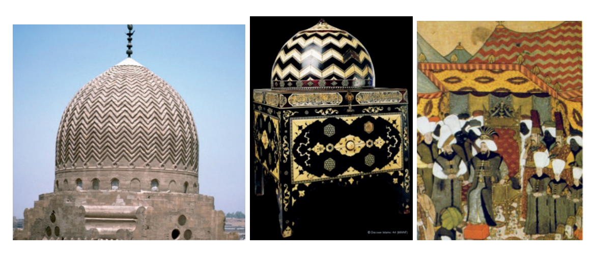
Fig. 10. Mamlūke dome, dressed with the zigzag kiswa design with its carved attachment rings, over the Khanqah of Sultan Faraj ibn Barquq, 1411, Cairo. Echoing the design on the kiswa of the haramayn and so visually displaying the evidence of the Mamlūke Sultans' laqab, Khādim al-Haramayn al-Sharīfayn. https://dome.mit.edu/bitstream/hand-le/1721.3/72892/163062_cp.jpg?sequence=1