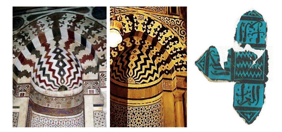
Fig. 7. The black, white and red zigzags that flow out from the Name Allah within the semi-dome of the mihrab and the Name repeated at the apex of the niche, in the Khangah of Sultan al-Ashraf Barsbay, Cairo, 1432.