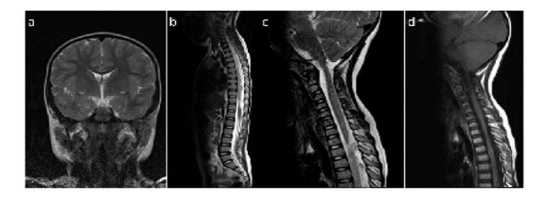
Figure 2. One week later MRIs, T2 hyperintens lesions disappeared in brain and cervical medulla spinalis whereas lumbar remained sequelae.