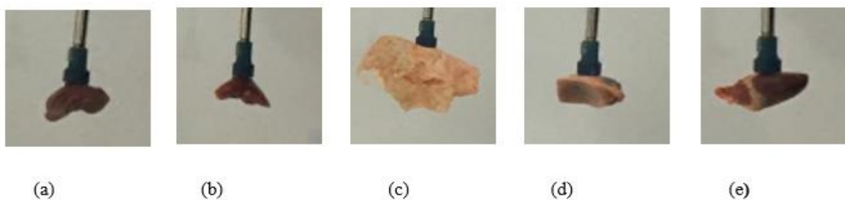
Figure 3. Non-contact handling of tissues by gripper (a) liver, (b) lung, (c) skin, (d) gizzard, (e) hearth

An experimental setting is used to manipulate chicken infarcts by means of non-contact gripper. This gripper is constructed by 3D Printer technology and fit through a 15 mm trocar. Prototype is connected to compressed air tank for test on chicken tissues and has two control options, grasping tissues and releasing tissues. In order to grasp, the gripper is held close on the tissue surface and air is open by manually. The tissue is lifted towards the nozzle surface by Bernoulli principle. In order to release the grasped tissue, air flow is closed which decreases the vacuum level causing the tissue to slip down of the gripper face. A simple manipulation is carried out by prototype. The chicken liver, lung, skin, gizzard and hearth are grasped and lifted vertically upwards 200 mm as shown Figure 3. This manipulation during test is repeated 10 times at the different air flow level as seen Table 2.