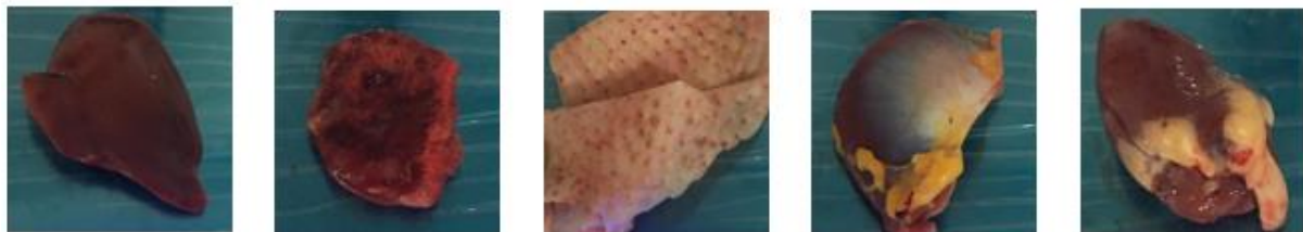
skin, the gizzard and the hearth without causing damage as seen Figure 4.

These experiments show that the tested organs can be handling with a gripper that works by the Bernoulli gripper. Especially, the use of a air deflector with 90 0 angle and radial Venturi channels on the gripper face give positive effects to the grasping force and completey eliminates imprints on the tissue surface. These tests show that a non-contact gripper can be used to grasp the liver, the lung, the