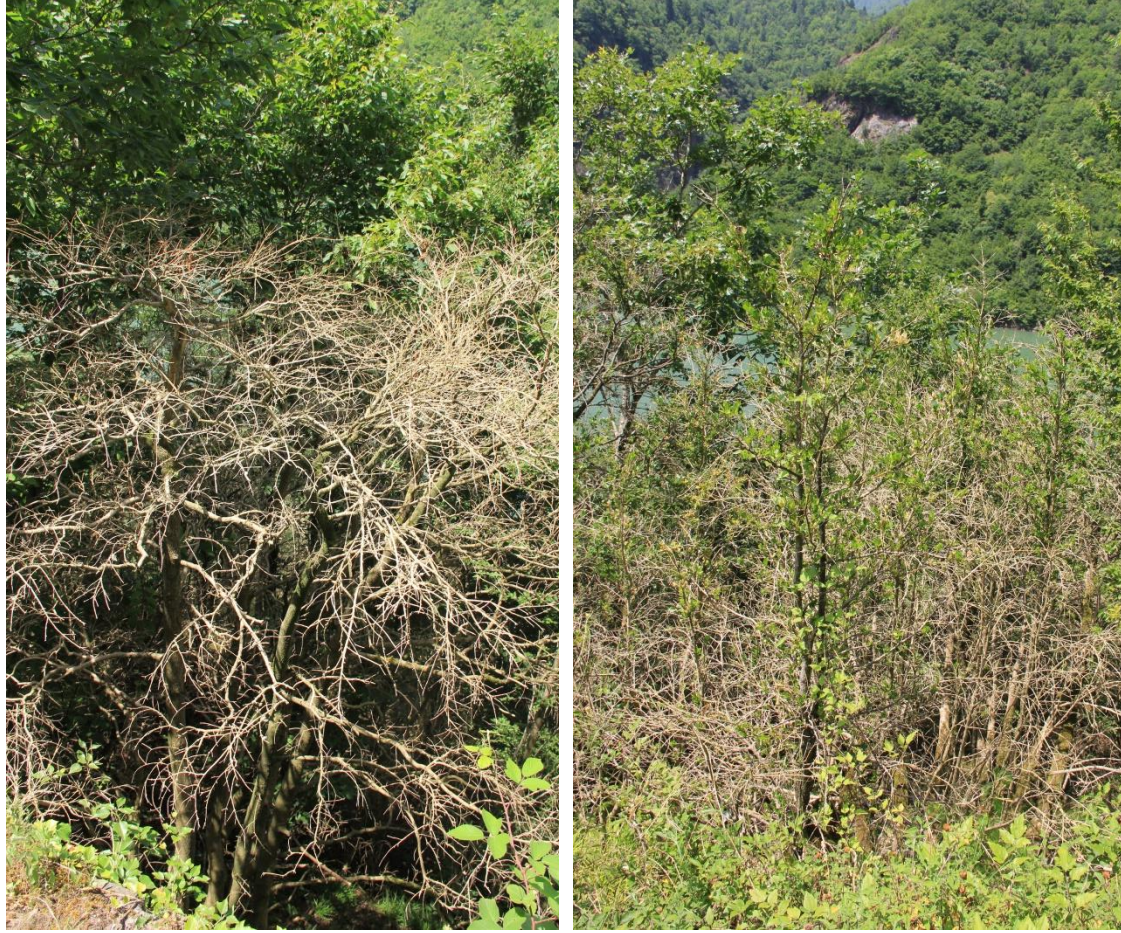
Figure 3. Naturally growing box plants that were fully defoliated and could not recover