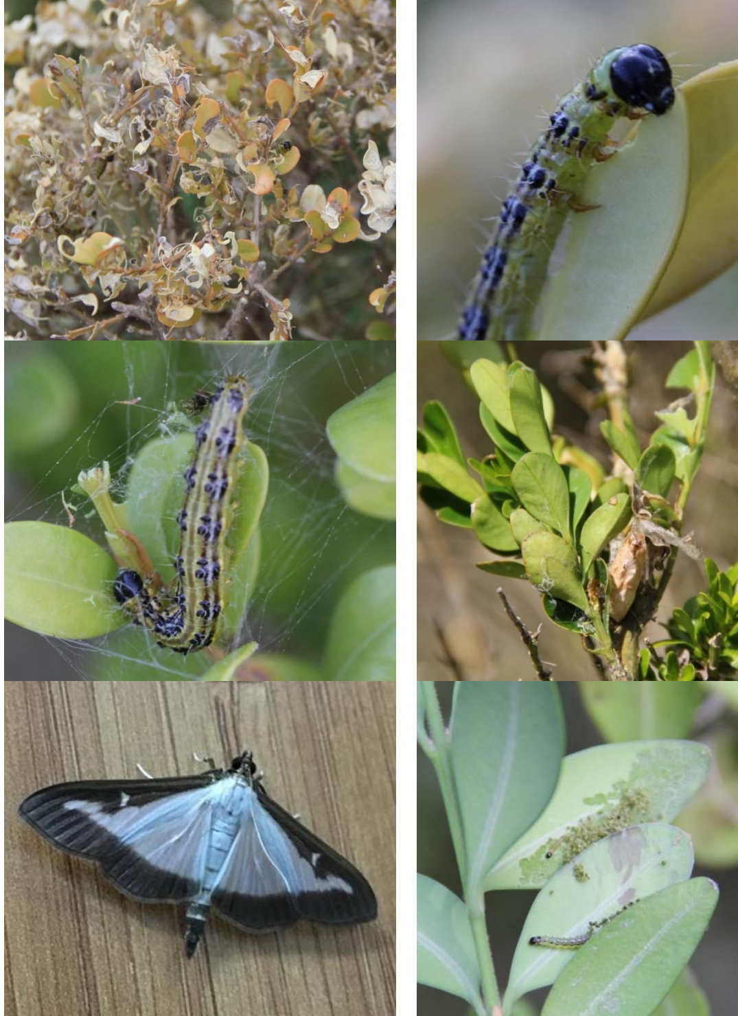
Figure 2. a. skeletonized leaves, b. late instar larva feeding on leaves, c. loose webbing around larva, d. pupa in the foliage, e. adult, f. young caterpillars feeding at the underside of the leaves