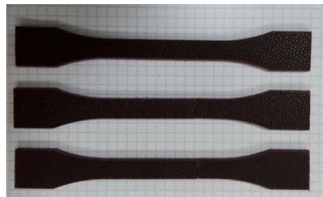
Fig. 5. Specimens that were broken due to the tensile strength test (Model C)