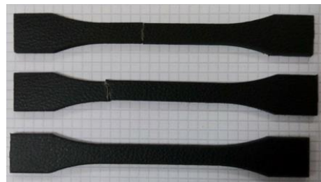
Fig. 6. Specimens that were broken due to the tensile strength test (Model D)