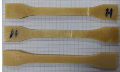
Fig. 3. Specimens that were broken due to the tensile strength test (Model A)

Figure 3, 4, 5, and 6 present the break points for the specimens that belong to four different models, as a result of the tensile strength test.