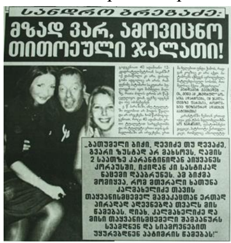
"Asaval-dasavali", 24-30 September, 2012

The weekly newspaper "Asaval-dasavali" is only one which covers "prison scandal" with the personal photo.