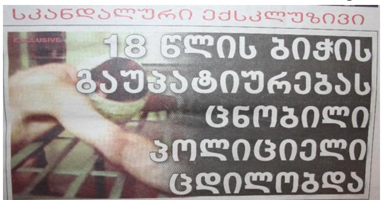
"Prime Time", 24 June, 2013

"Scandalous Exclusive" - written in red on top of the photo.