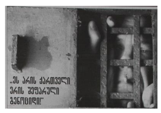
"Kviris Palitra", 23-29 January 2012