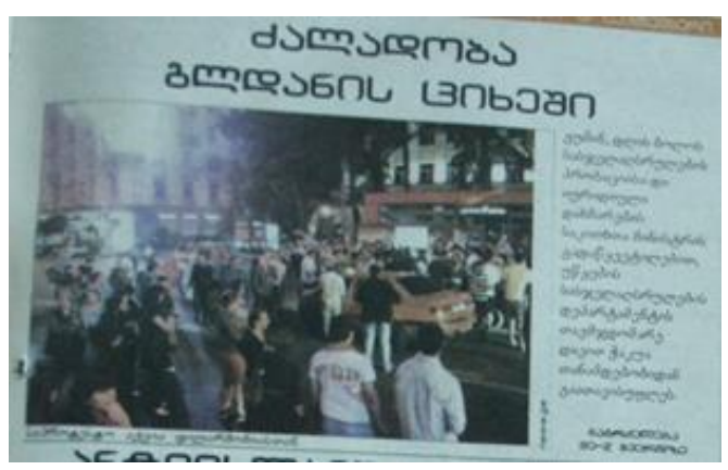
"24hours", 19 september, 2012

The newspaper "24hours" uses only situational photo to illustrate the prison scandal. The goal of this publication is to cover the public anxiety like an ordinary fact.