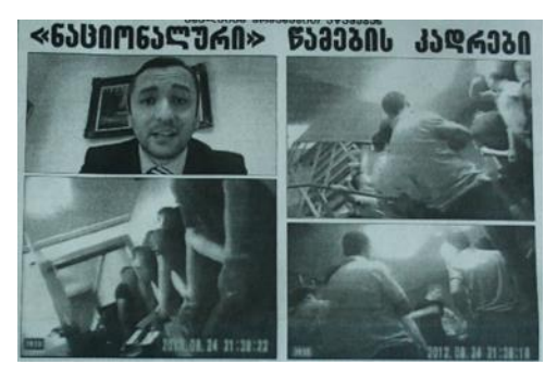
"Resonansi" September 19, 2012