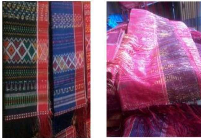
Fig 2. Ulos

This Ulos has a variety of bright colors. Usually this Ulos is used in cheerful events or other events, for example, giving Ulos to officials / community leaders with the aim of giving respect and compassion.