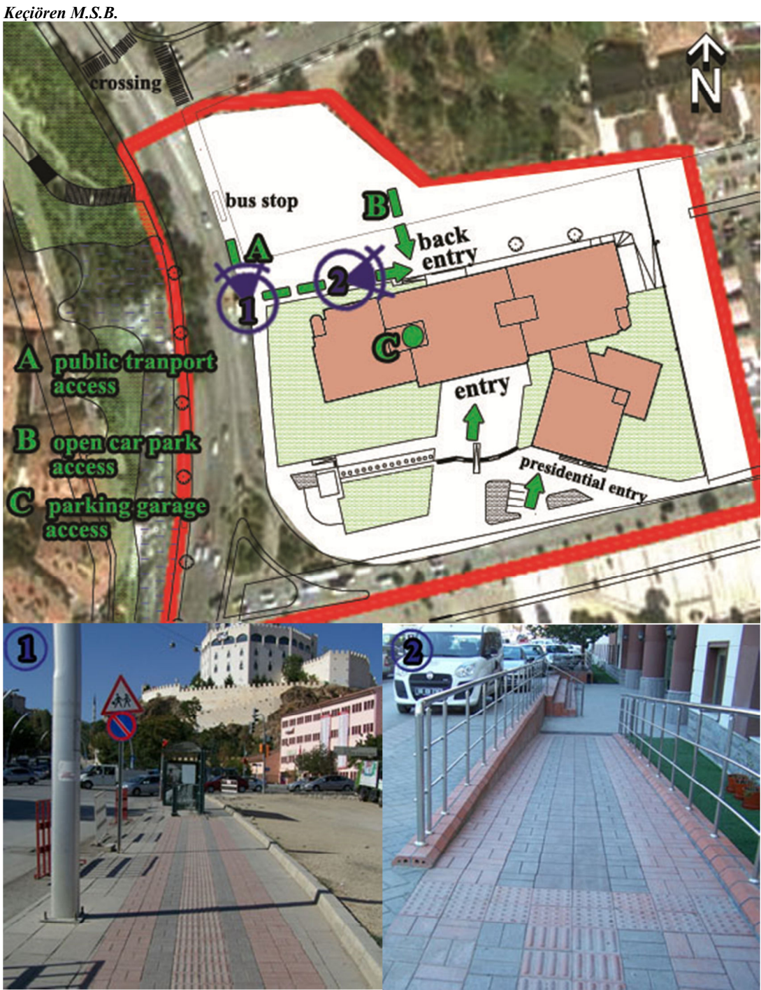
Figure 4 Enough dimensions for pedestrian walkways but obtrusive surfaces on lampost / Low-slope ramp and perceptable (but not in contrasting colored) markings along the route / lack of informative signage / Non-conforming railings and proutruding edges on each stairs around Keçiören M.S.B.