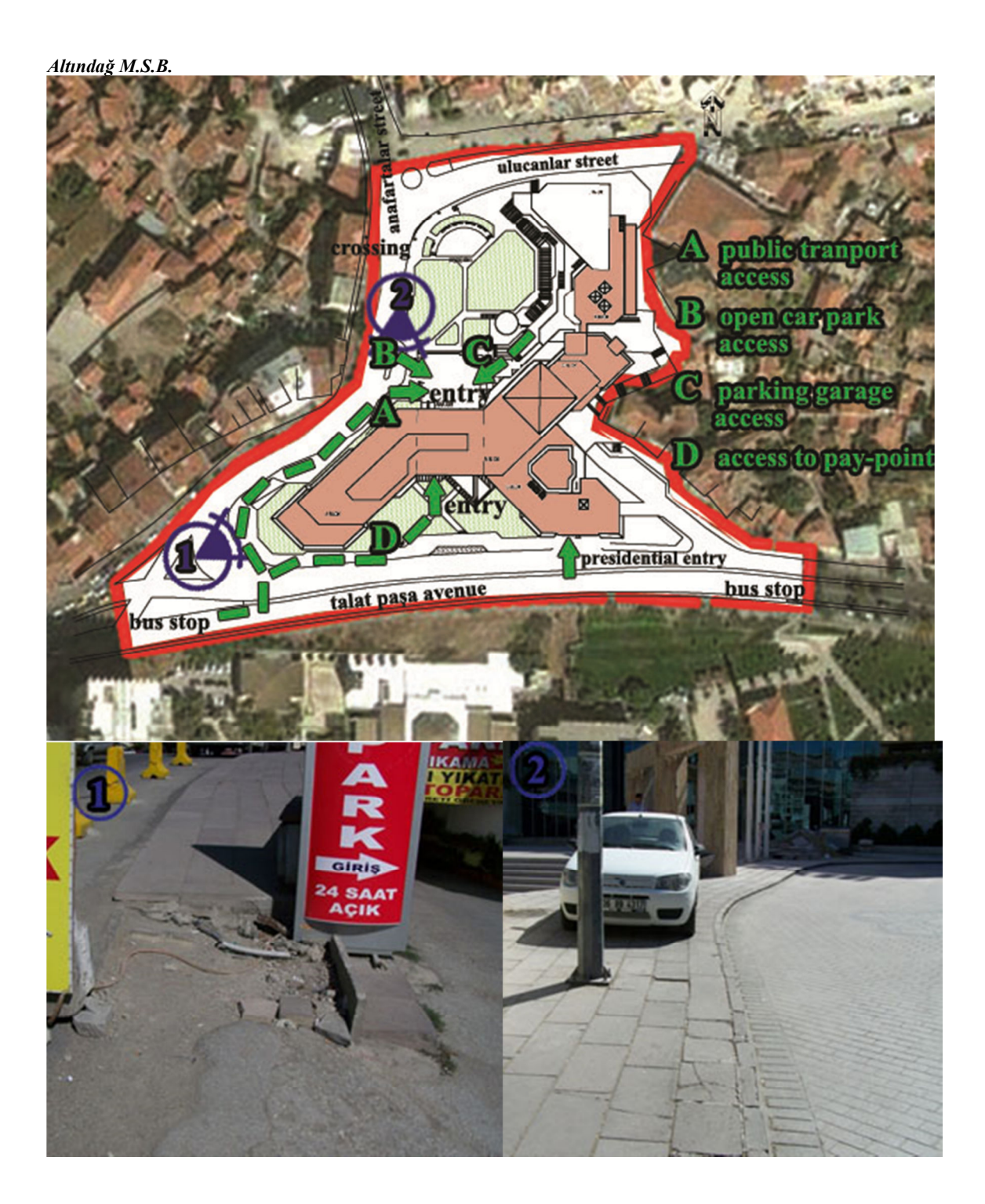
Figure 3 Non-even pedestrian walkways, deficient dimensions for accesible route, non signing with perceptible markings around / Non signed accesible car park, there are no curb ramp and non even pedestrians walkway Pavement road levels, non uniform external stairs / unprotected external stairs from weather conditions and lack of railings and non-slip markings around Altındağ M.S.B.

• The ramps along the pedestrian walkways are not as wide as 900cm and are not between 6% to 8% slopes (TS 9111 Section 4.3.7)