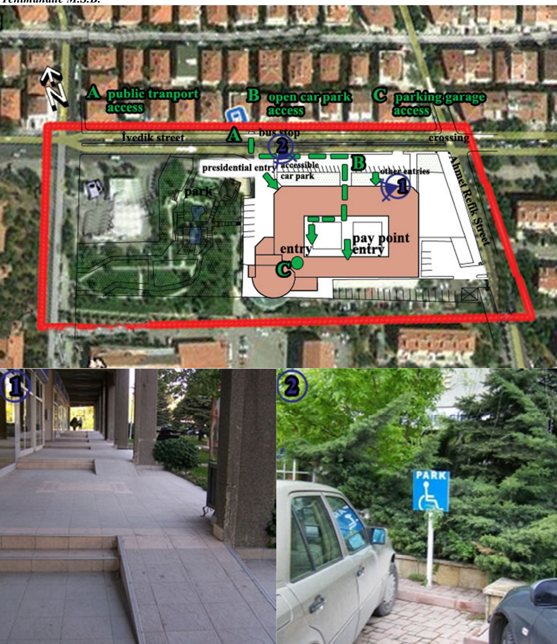
Figure 5 Lack of side railings and informative signage around / Low-slope ramp with no-perceptable markings along the route Yenimahalle M.S.B.