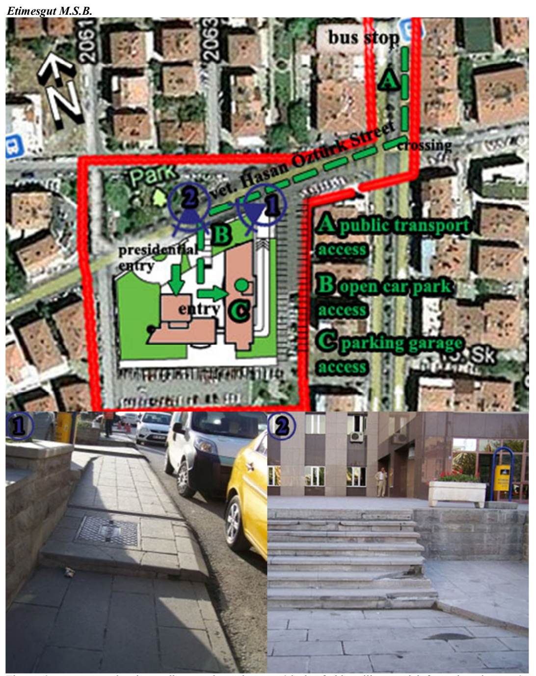
Figure 6 non-even pedestrian walkways along the route/ lack of side railings and informative signage / un-protected external stairs from weather conditions around Etimesgut M.S.B.