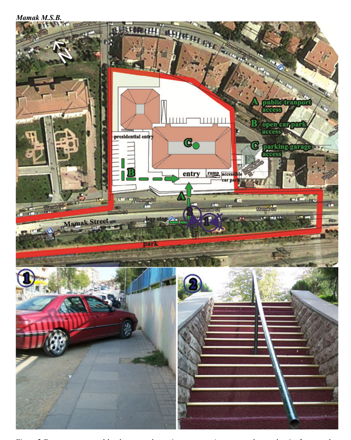
Figure 2 Even pavement-road levels causes obstructions on route / un-protectedexternal stairs form weather conditions, lack of side railings and non-slip markings on edges of stairs / External ramp well designed but not protected from weather conditions and not signed with perceptable markings around Mamak M.S.B.