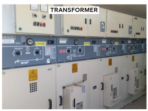
Figure 2. A view from module, MPPT + inverter and transformer of the system

Technical specifications of polycrystalline silicon PV module is given in Table 1. As seen in Table 1 that each PV module has 60 cells, 16.32% peak efficiency (under STC: Standard Test Conditions: irradiance @ 1000\text{W/m}^2 with an air mass 1.5, module temperature @ 25^\circ\text{C} and @ 0m/s wind speed), 1.6236\text{m}^2 area, 18.5kg mass, 45\pm2^\circ\text{C} nominal operating cell temperature and 97.5%, 90.0%, 80.0% of overall efficiency for first year, 10 years and 25 years, respectively (Table 2). The efficiency of solar PV panels is affected by environmental and climatic conditions, temperature, dust and using time [2, 3, 7, 13, 15, and 16]. In addition to this, other components of the SPPs such as MPPT, inverter, and transformer has efficiencies that commonly changing between 95%...99% [9]. The maximum efficiency of solar panels can also be gathered in first year.