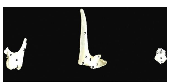
Figure 1. The ossicula auditus in male Hemshin sheep.

presence of processus lateralis, processus rostralis, and processus muscularis was observed on os malleus. The length of os malleus, os incus, os stapes were measured as right/left 7.00\pm0.76/6.58\pm0.085 mm, 2.89\pm0.3/2.83\pm0.68 mm, 1.76\pm0.13/1.88\pm0.17 mm respectively. Despite the fact that macroanatomical findings, there was a numerical difference between the right and left ossicula auditus, but there was no statistically significant difference between the right and left ossicula auditus (P>0.05).