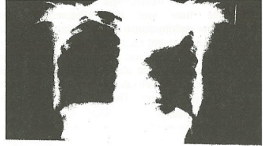
Fig 1. Radioopaque mass take place at upper-left chest x-ray.

cytometric study was performed on formaldehyde fixed and paraffin embedded biopsy material. The DNA content of the tumor was diploid.