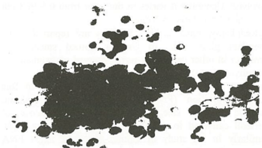
Figure 2: Multinuclear giant cell and adjacent clusters of basaloid cells (May Grünvald Giemsa X 400)