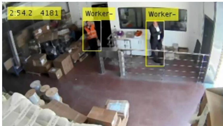
Figure 4.1. Result 1

In this section, we presented the results we have found in our works using our algorithm both in storage and construction areas. There are three screenshots which are taken from three different videos (Figure 4.1, 4.2, 4.3). Three videos are recorded from storage rooms and one video is recorded from a construction site.