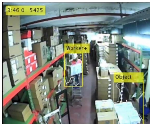
Figure 3.4. An example screenshot for double-sided area classification.

The threshold is the same with the previous method 4 is an example to show how this method works.