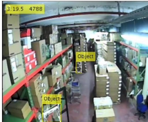
Figure 3.1. An example screenshot for size classification.

\tau_2 is the size threshold. 1 is an example to show how this method works.