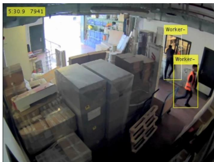
Figure 4.2. Result 2