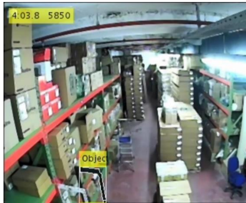
Figure 3.3. An example screenshot for area classification.

It can be seen from the Figure 3.2. that the proportion of the rectangle enclosing the human is inside threshold limits. Its height is longer than its width which we expect from a human.