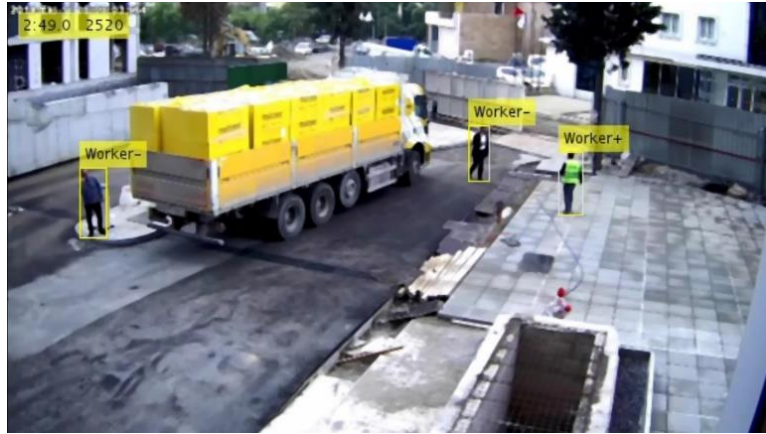
Figure 4.3. Result 3

Sometimes workers' clothes may blend with the background and cause those workers not to be detected or they may stay where they are with minimal movements which confuse algorithm and makes the worker a part of the background image. Some drastic and continuous weather changes also cause some problems since the background image is also changing with the weather. These problems can be overcome with dynamic background subtraction and calibration on site.