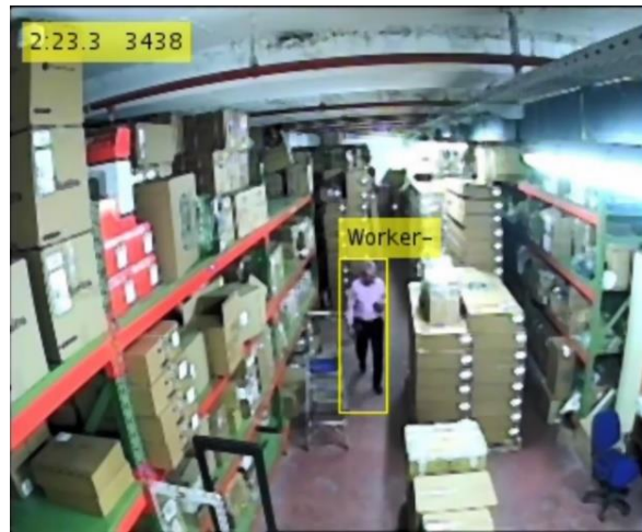
Figure 3.6. An example screenshot for helmet detection.

The white pixels exceed the threshold and hence the confirmation for a helmet on Figure 3.5.