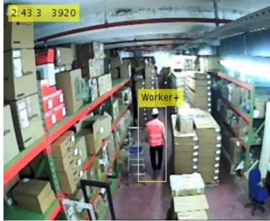
Figure 3.5. An example screenshot for helmet detection.

The white pixels exceed the threshold and hence the confirmation for a helmet on Figure 3.5.