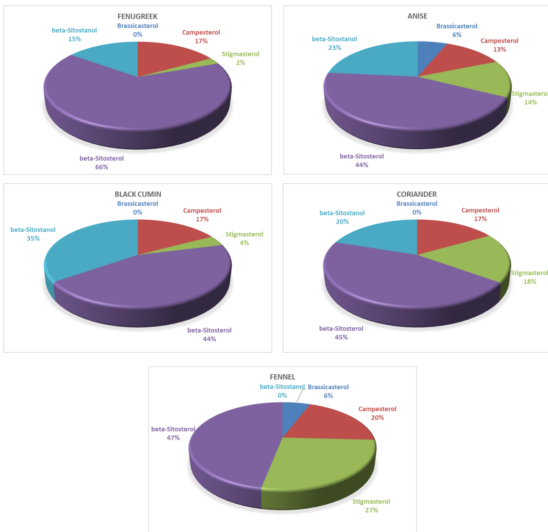
Figure 2. Profile (%) of the sterols determined by the method having no silylation agents

(2008). Campesterol values in black cumin were calculated as in the range of 12.09 and 13.76% by same authors while the ratio of campesterol in our study was 17.18%. Jazia Sriti et al. (2011) reported that the \beta -sitosterol content in coriander was 21.33-21.97 mg/g and these values were higher than the results of our study.