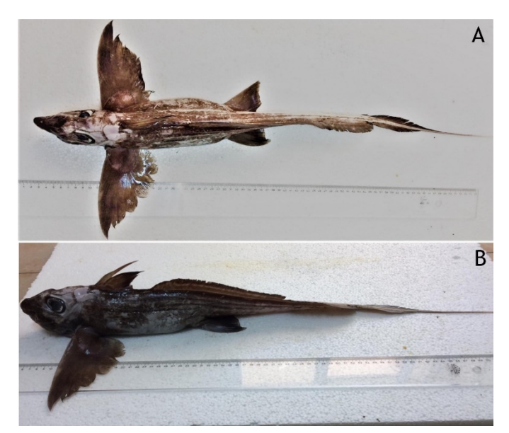
Figure 2 . The specimen of the C. monstrosa from the deep seas of Northern Cyprus (A: Top view; B: Lateral view)