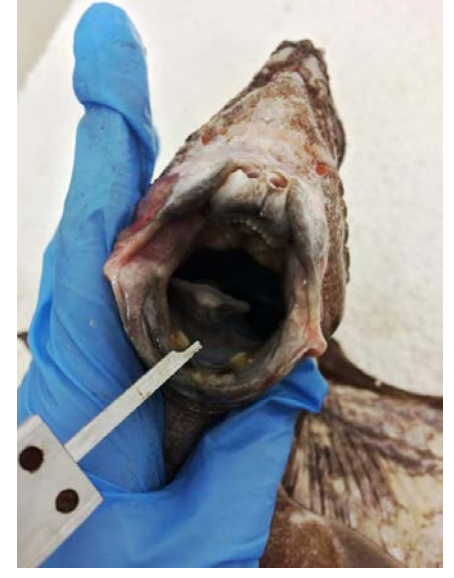
Figure 3. A pair of mandibular plates detected in the lower jaw of C. monstrosa

C. monstrosa , known to be widely distributed species in the Mediterranean. The reason for the lack of record for the island of Cyprus so far may be that target fishes are living shallow waters when compared with C. monstrosa so that fishers do not perform fishing operations in these depths.