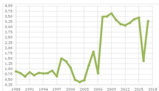
Fig. 2. Mersin's agricultural credit share in Turkey (%), Data is calculated depend on Anonymous, 2019

Therefore, this study aimed to investigate the relationship between the credit usage of apricot farmers in the