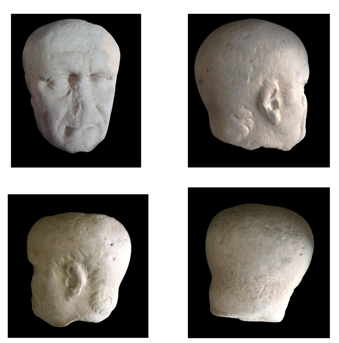
Plate I. Bergama Museum, Vespasianus Portrait. (Photo: Yaşar ARLI, 2017).