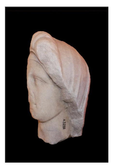
Plate II. Antalya Archaeology Museum, Private Women Portrait. Photo: Yaşar ARLI, 2017).