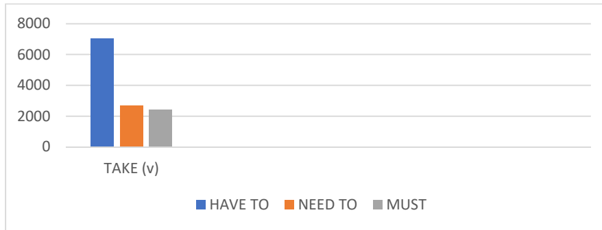
Table 6. Distribution of “need to, must, have to” for the verb of “take” in COCA

The sentences below show that people tend to use “take credit” with “have to” recently. The sample sentence from 2002 indicates that it was used with “must”; however, people have preferred “have to” for similar meaning and function in recent years.