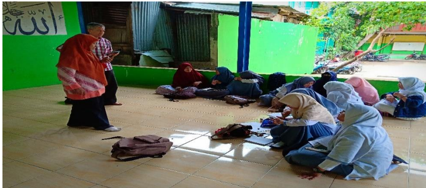
Figure 3. Collaborations of volunteer tutor with Master tutor

Collaborations among tutors are either from state or private universities, also completed by people individually, for instance, Mr. SB, an ex NGO employee.