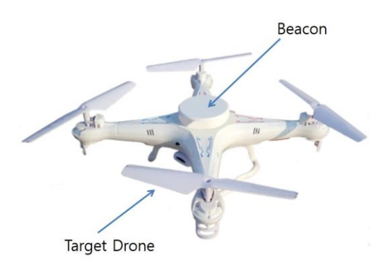
Figure 2 Beacon system design on the Phantom 4 Pro