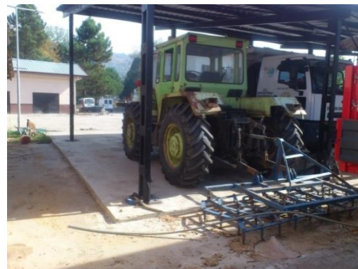
Figure 5. Preparation of seeding beds using manpower (left) and machine (right)