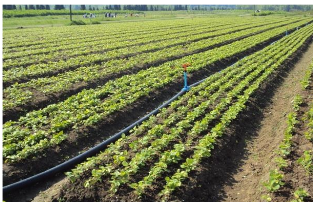
Figure 3. Beech seeding plots (Anonymous, 2019)

In the comparisons, Break-even analysis was utilized in order to determine the conditions, under which the work stages realized, using machine equipment would be more economical than those performed with the manpower (Varol and Özel, 2015). The following equation was used: