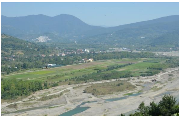
Figure 1. A view from the nursery (Anonymous, 2019)

The research was carried out in Gökçeşey Forest Nursery Department of Zonguldak Regional Directorate of Forestry. Gökçeşey Forest Nursery Department (Figure 1) was established in 1984 in an area of 701 decares, and it is located at 45 m altitude with northwest elevation and lower slope conditions. In seedling activities, the broadleaf seedling production is the top at list in Turkey.