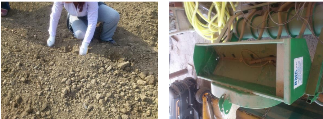
Figure 6. Sowing with manpower (left) and machine (right)

In a study, in which the production activities carried out at the nursery stage were examined, it was found that the applications made with the sowing machine during sowing activities carried out in a large area with 34 cm intervals on 120 x 100 m European beech and scotch pine seeding beds, 43.5% and 32.7% efficiency was achieved per-unit-time. In addition, in this research conducted in Finland, the contribution of seedling production by using mechanization techniques to the country's exportation was reported to be high (Laine, 2017). In the studies carried out by Ersson et al. (2018) using both tracked and wheeled excavators, sowing ranging between 150-265 per hour were realized. The results obtained from the studies conducted in Finland and Sweden in 2017 were similar to our study in which approximately 240 plantings were carried out per hour. The sowing process with the machine S 237 in Poland was found to be 33% more efficient than manpower (Osmolovskiy and Granik, 2014).