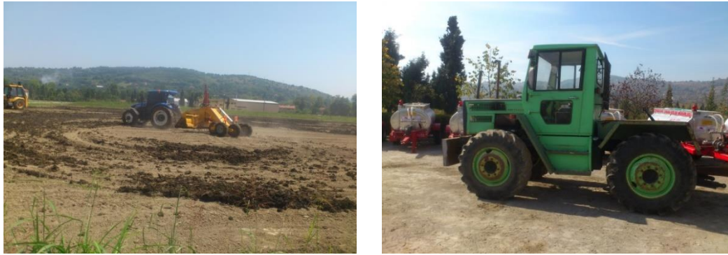
Figure 4. Soil Tillage