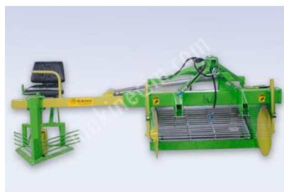
Figure 8. Seedling uprooting machine

methods for the uprooting of 1023 beech saplings, which were 2+0-year-old and Tefen originated, on a total of 4 seeding beds located in the plot no 7 of Gökçeşey Nursery in September 2018 were compared. As a result of the comparisons made with ANOVA, a statistically significant difference at 99.9% confidence level was found between the uprooting procedures. Within this context, the results of the Duncan test, which was applied at 95% confidence level and aimed to group the procedures, are given in Table 7.