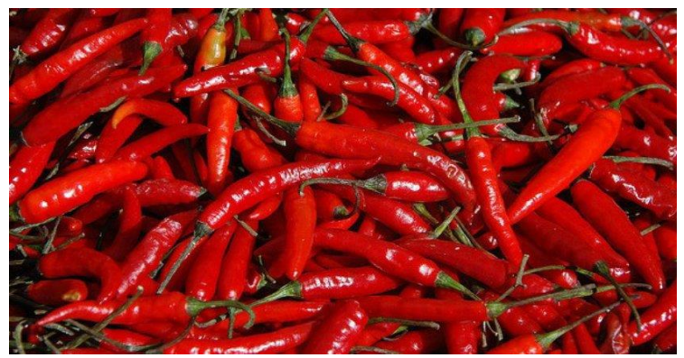
Fig.1. Red chili pepper(Capsicum annuum L.)

The aim of the study is to investigate the effect of the protein compounds isolated from the aqueous extract of the red chili pepper on some biochemical parameters in experimental animals. Hopping to isolate an active compounds having insulin-like action and / or structure.