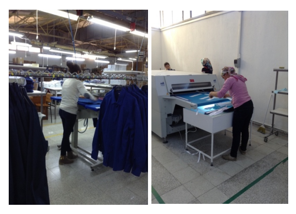
Photograph 2: Unergonomic Working Areas

When the photograph 1-2 are examined, it is seen that the employees working in the apparel sector work under unergonomic conditions and with unergonomic equipment.