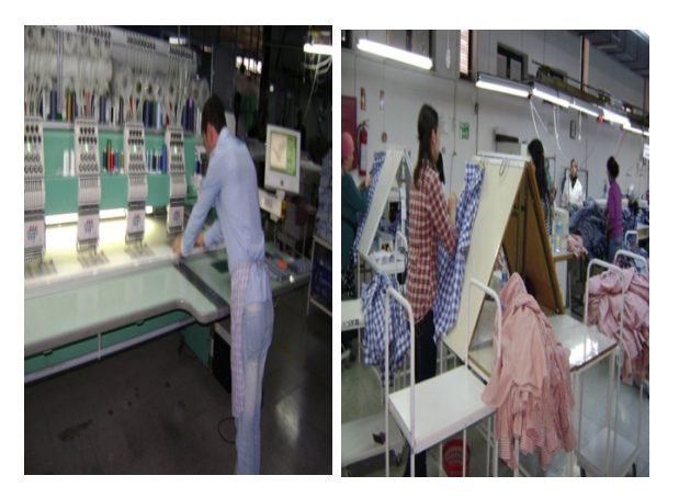
Photograph 1: Unergonomic Working Areas

With the arrangements to be performed, business systems can be made more ergonomic and the problems that an employee may experience pertinent to work or workspace may be minimized.