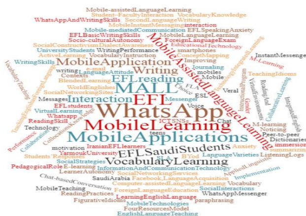
Figure 2. The keyword cloud of the keywords

The keywords were analysed by copying all of them from the selected articles and putting them in Vocab Profiler ( http://www.lex tutor.ca/vp/eng/ ), a website that analyses texts for types and tokens. In addition, a keyword cloud is provided (Figure 2) to illustrate the prominent keywords and thus to show the way WhatsApp is used in the empirical studies. Except for two articles, all of the articles had keywords. There were 158 keywords which had 84 types (i.e. a unique word) and 171 tokens (i.e. any occurrence of the types).