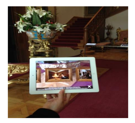
Figure 2: Family Rooms QR Code and AR Scene

On the second floor, under the title of "Golden Letters: Ottoman calligraphy and tableaux collection from Sabancı University Sakıp Sabancı Museum" there is The Arts of the Book and Calligraphy Collection section which is the first Turkish collection and private calligraphy collection being exhibited in New York Metropolitan Art Museum. Within the sections included to The Arts of the Book and Calligraphy Collection such as "Calligraphers' Skillful Works: Muraqqa and Kıt'a, Beautiful Mural Calligraphies: Levha and Hilye-i Şerif, From the Pigeonhole of a Calligrapher, Echoes of Faith: Books of Prayer with Pictures, Holy Scripture of Muslims: Kuran-ı Kerim, Treasure of Booklovers: Artistic Manuscripts", thanks to AR applications miniatures invigorate.