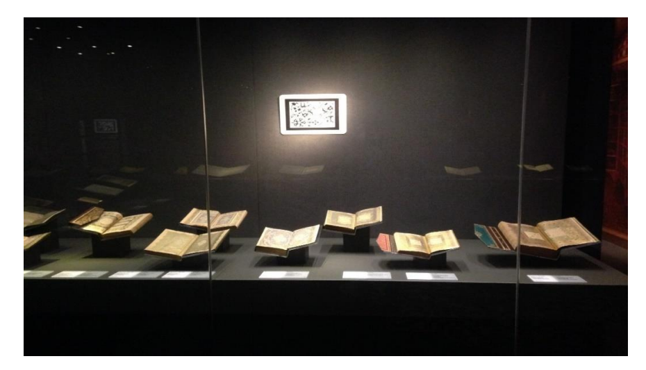
Figure 3: Turkish and Islamic Arts AR Application