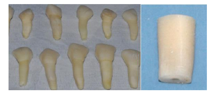
Figure 1. Bovine teeth and standard root samples (12- mm)