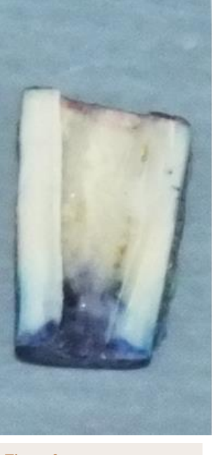
Figure 3. Longitudinal section sample

30X magnified images using Image Focus 4.0 (Euromex, Arnhem, Germany).