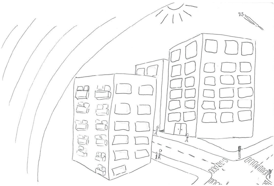
Figure 9. A person walking on the street and an airplane has just taken off.