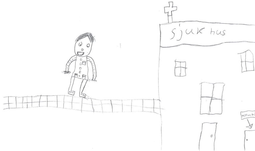
Figure 3. A nurse on the way to work at a hospital. Translation: Sjukhus = a hospital, Akut = Emergency room

experienced. The next theme illuminates visions that have little personal or individual framework. It expresses an apocalypse of the world and has a framework of long distance in all respect: spatial, temporal and moral.