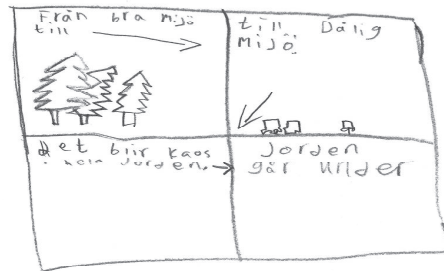
Figure 6. From good environment to bad environment, chaos and the end of the world. Translation: Environment. All the trees will be cut down and it will be chaos in the environment and finally the world goes under.

Miljön. Alla träd osv kommer man hugga av. Och miljön kommer bli kaos och jorden går under