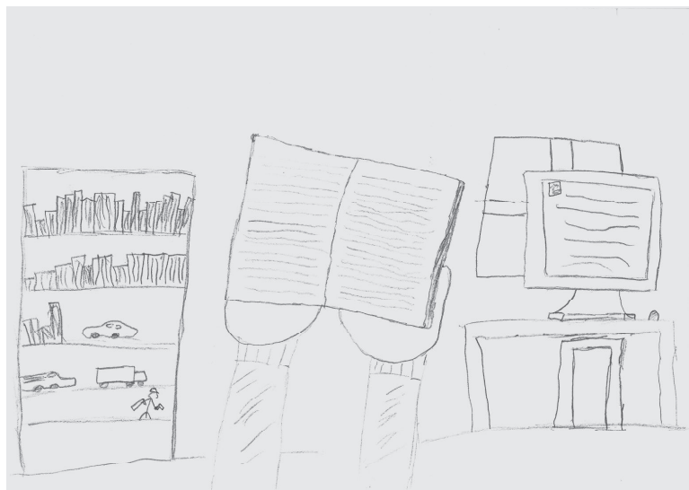
Figure 4. Home as a workplace.