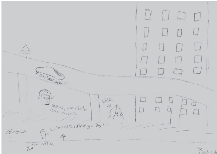
Figure 1. Flowing cars, portable houses and possibilities for teleportation. Translation of the text in a drawing: Flowing cars and houses that can be moved. There is a tent and a footpath as well as flowing shoes. Teleportation is very expensive.

These visions may be answers to the question ‘What will it be like in society in the future?’ Some of the technological solutions were motivated by environmental arguments. For example, one child argued: “We are going to have electric cars instead of gasoline cars. Perhaps it is going to be some new invention like a flowing car that is not so bad for the environment” (Figure 1). Another drawing (Figure 2) expressed a society built on the moon. This child explained that he believes that people will be able to live on the moon in the same way as they do on the earth. The moon will just be an alternative environment to live in –he didn’t believe that the society or culture would be any different. He said: “People go to the moon just because it is possible. I wouldn’t want to live there but perhaps I could visit it.” He also explained that the person in his drawing is not him but another child playing football.