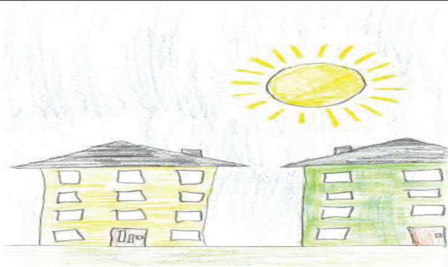
Figure 8. Two apartment houses and a sunny day.

Children's visions of the future were sometimes emotional. Due to this they found it hard to describe them through activities or objects, as in previous themes. Feelings of anticipation about the future may focus on the psychosocial elements of life, which are hard to describe either visually or verbally. One child, however, drew apartment blocks that reminded him of the buildings beside the school (Figure 9). He explained that the future would 'look like the usual'. The sameness of his versions of the present and the future might be an expression of the difficulty he found in expressing temporal distances.