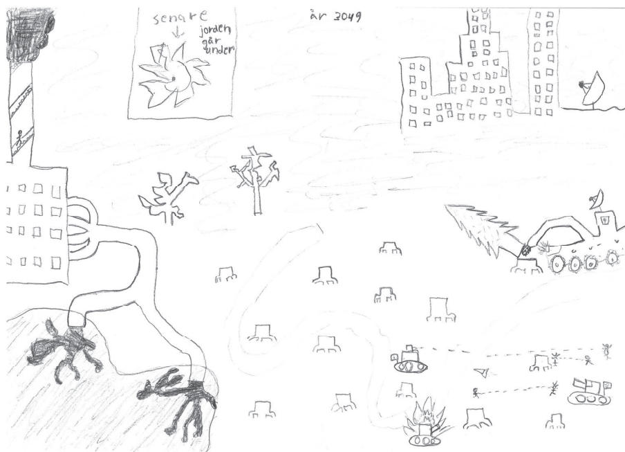
Figure 7. The year 3049 and the world is heading towards its end. Translation: år = year, Senare jorden går under = Later the world goes under.

The underlying threats seen to be leading to the apocalypse are both social and environmental. The catastrophe may depend on conflicts between humans or between us and nature (forest, water and air). In Figure 6 the child describes a war of oil and has written: "Give us your oil!" This shows an issue of conflicting human interests concerning natural resources. The framework of these drawings is global because the development of various problems is leading to the total disaster of the earth instead of just some part of it. In