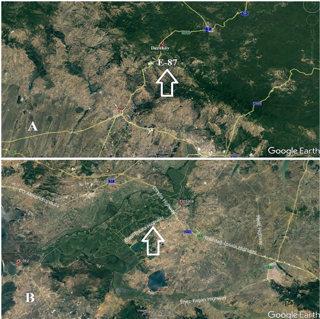
Figure 1. The map showing the localities of the observed individuals exposed to road-kills in Kırklareli (A) and Edirne (B) provinces of Turkey.