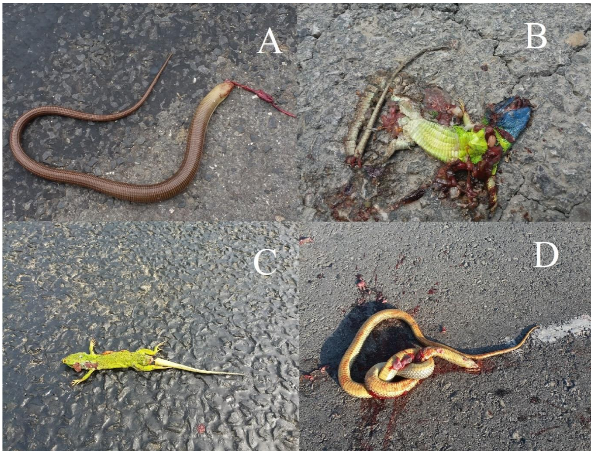
Figure 2. Images of some reptile carcasses found on Enez-Ipsala and E-87 highways. A- Pseudopus apodus , B- Lacerta viridis , C- Lacerta trilineata , D- Dolichophis caspius .

representing 11 species. The species involved in the crashes are given in Table 1 and their status was reported according to IUCN criteria. Photos belonged to some of specimens, which exposed to car crashes, were given in Figures 2 and 3.