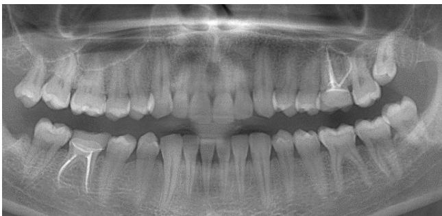
Figure 2. Panoramic radiography of endodontically treated teeth and cemented overlays on #26, #46