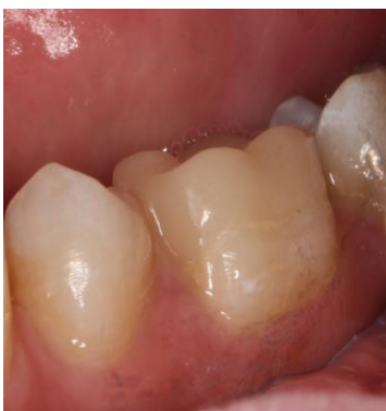
Figure 4. Photo of overlay on #46 at 1 year