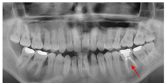
Figure 6. Panoramic radiography of the patient

A 26-year-old female patient was presented to Restorative Dentistry Department after the endodontic retreatment of #36 (Figure 6). It was decided to do overlay restoration in order to strengthen the weakened non-vital tooth structure (Figure 7, Figure 8).