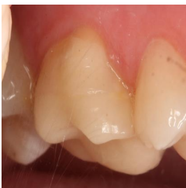
Figure 3. Photo of overlay on #26 at 1 year