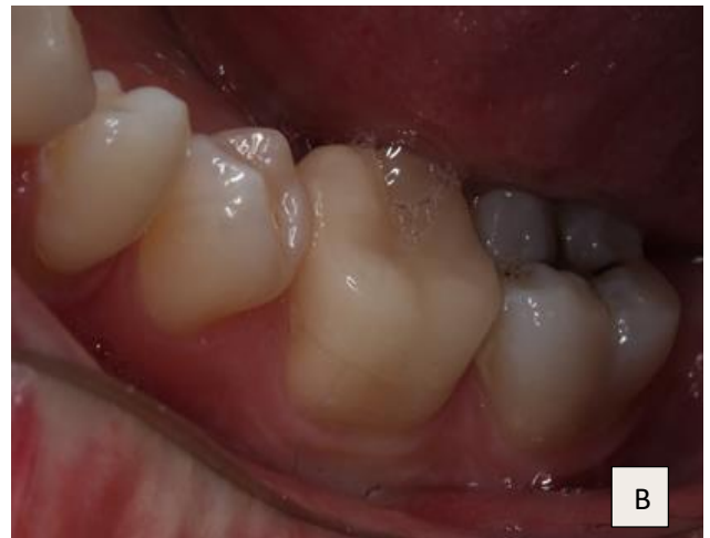
Figure 5. Photos of overlay on A) #26, B) #46 at 2 years