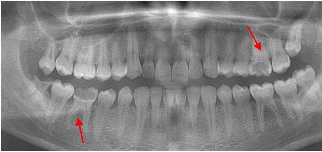
Figure 1. Panoramic radiography of the patient