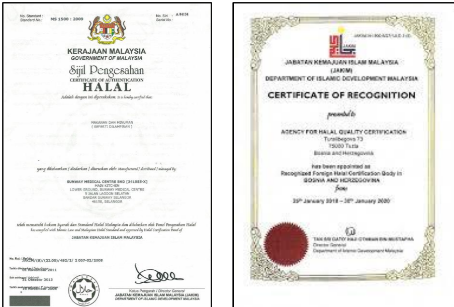
Figure 2: Example of halal certification in Malaysia