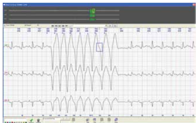
Figure 2. The patient's 24-hour Holter recording showed non-sustained ventricular tachycardia episodes

and the voltage, amperage, and resistance involved with the event. A direct strike is the most dangerous as opposed to an indirect hit off another object (side flash) or nearby ground (ground strike). Blunt injury is another mechanism by which lightning can inflict bodily damage, secondary to its explosive force as it passes through the air (4).