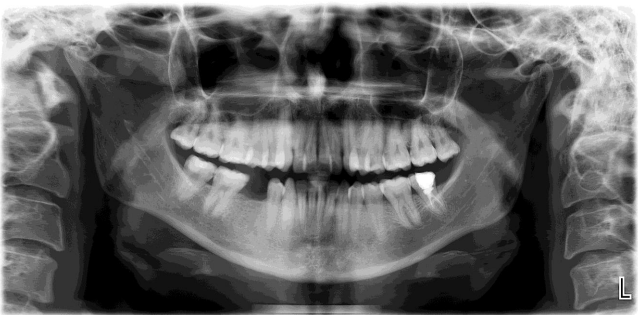
Figure 3: Multilocular PAE on the right and unilocular PAE on the left.