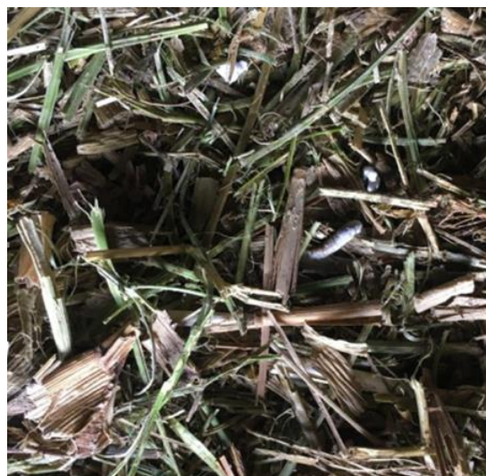
Figure 2. Image due to looting (grooves)