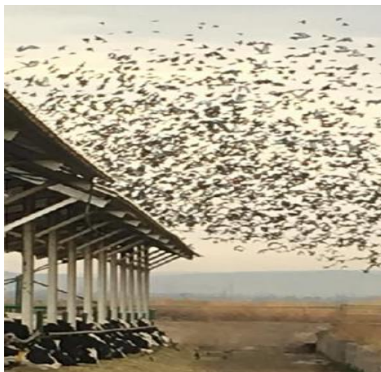
Figure 3. Flocks of starlings in dairy farm

When it is considered that starlings can create larger flocks (Figure 3) and it is added to the damages caused by diseases caused by starlings, it is obvious that losses in cattle farms can be much more. Harmful bird populations (starlings and pigeons) are estimated to cause an annual loss of $ 100 million to the United States due to microbial contamination (Lee, 2005).