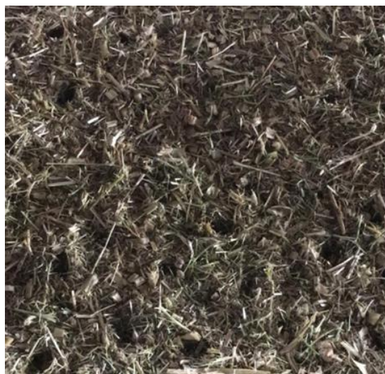
Figure 1. Image caused by looting (grooves)

Both Figure 1 and Figure 2 are the images of TMR that are caused by the looting of grain and pellet feeds and reflecting the severity of the looting. Table 1 shows the changes in nutrients that occur in ration due to invasive and predatory starlings in a dairy cattle farm.