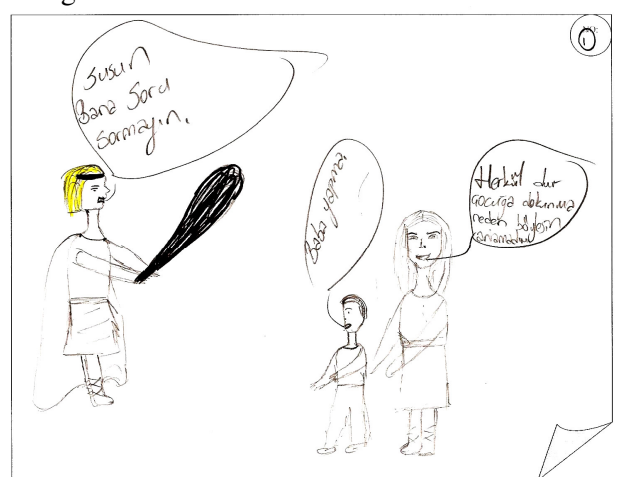
Figure 4 Hercules is murdering his family

Girls choose emotional aspects of the story such as murdering of Hercules' his family. (Figure 4) The children also excluded represent the some scenes such as Hercules' sailing to Black Sea with Argonauts. It would be say regard to this lesson that the mythological story drawings from Turkish children, revealed the characters, particularly the psychological dimension, through action.