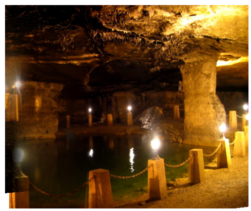
Lesson and motivation

School's art teacher asked one class of sixth and seventh grade pupils (8 girls and 9 boys) to discuss cave's story and gave them little information what is going to do in the Cave. She believed that drawings "bring to life beliefs about the cave's story which is told between people lives in the Town." We passed out four pieces in A4 size paper, crayons and supporting pads to the pupils. We also asked them bring a cushion to sit in the Cave. We discussed the story with them. Children talked about previous visits to Cave. Most of them were been in the cave before. I told the story them once more. Even if they know the story, I wished to keep their attention in hyper situation. In this case, room temperature, noise level (echo), physical environment could create perfect atmosphere in the cave. Thus, their imagination could be empowered with the environment. I had already done telling practice in terms of gestures, voice level.