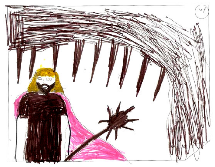
Figure 1 Stalactites are common interior element in most of the scenes