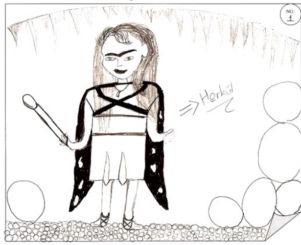
Figure 2 Hercules

Six students drew Hercules dressed with fur. Four female students drew spotted furs with different colors. And zigzag bottom cut. A pupil said that He inspired the appearance of figures from Flint Stones Cartoon. Most of the students drew Hercules long haired, bearded and wearing cape. Hercules holds maze in his hand in most drawings. Most students drew people from the side view, but two students (a boy and a girl) drew humans from the front view. Two particularly advanced drawing, for instance, consisted of a Hercules, son and mother (from left to right) in rear view with another front view.