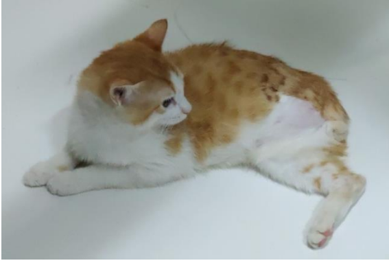
Figure 3. Postoperative 2nd month view

It was observed that the cat's condition improved in two months postoperatively and the kitten continued his life without any problem (Figure 3). In addition, there was no clinical and radiographic finding of metestasis, including the lungs.