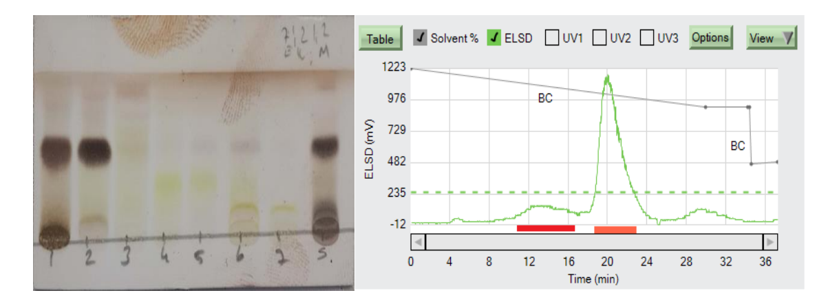
Figure 1. TLC view and Flash chromatography chromatogram of C18 fraction F-1 and F-2

filtrated using 0.22 \mu m syringe filter. The methanol and cold-water extracts were diluted 1:20 and 1:10 respectively. The final solutions were injected into HPLC. The arbutin contents of extract were expressed as mg arbutin/g extract and % arbutin content of dry biomass. The HPLC-UV chromatograms of standard arbutin and plant extracts were given in Figure 2.