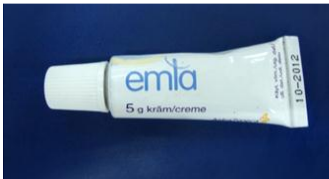
Figure 1. Eutectic Mixture of Local Anesthetic 5% cream.

Group III: Lignocaine 15% spray (ICPA Health Product, India)