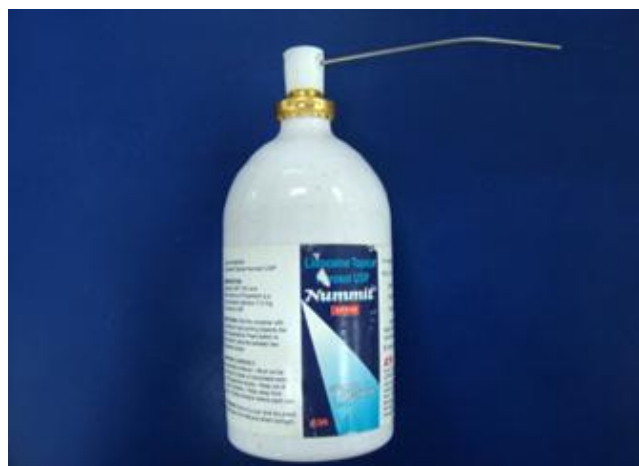
Figure 3. Lignocaine 15% spray.