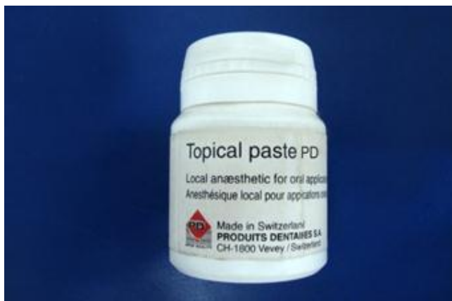
Figure 2. Produit Dentaire gel (20% Benzocaine).