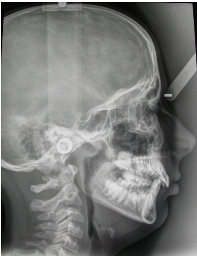
Figure 2. Teleradiography.

The occlusion revealed a first skeletal class, confirmed by the examination of the cephalometry. In our case, after an instruction of oral hygiene, a follow up of 2 years has been carried out, and the decision to wait for natural exfoliation of the primary molars was taken for the first years, to control the level of bruxism.