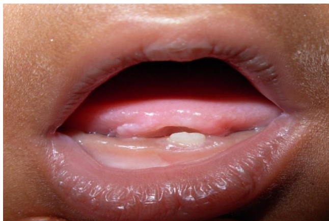
Figure 1. Intra Oral Photograph of 3 month old infant showing Neonatal Tooth in mandibular anterior region.

Examination also revealed 6 mm x 11 mm ulceration on the ventral surface of tongue that extended from anterior border of the tongue to lingual frenum (Figure 2). On palpation, area elicited a pain response from the patient.