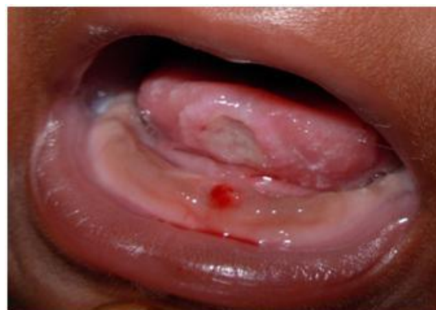
Figure 3. After Extraction of Neonatal Tooth.

As the neonatal tooth was the suspected cause of the ulceration and pain, extraction of the tooth was chosen as treatment of choice. Extraction was carried out under topical local anaesthesia, which the infant tolerated well (Figure 3).