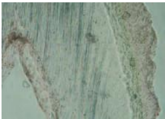
Figure 5. Ground section of the neonatal tooth showing irregular arrangement of enamel rods & irregular DE junction.

Patient was re-examined after 3 weeks. Examination revealed complete healing of the ulcer and the extraction socket (Figure 6).