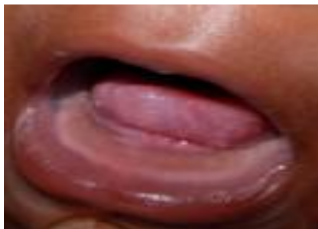
Figure 6. Healed ulcer after 3 weeks.

Hence it was possible to confirm that the neonatal tooth had been a supernumerary (Figure 7).