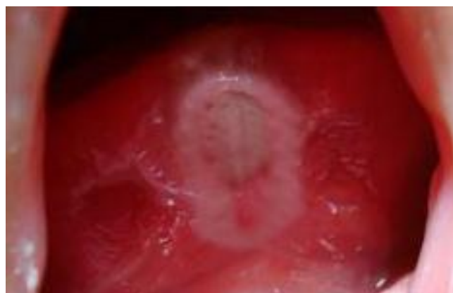
Figure 2. Intra Oral Photograph showing 'Riga's papilloma' on the ventral surface of the tongue.

Examination of the rest of intraoral mucosa revealed no other lesions.