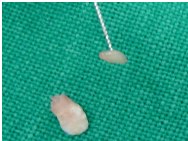
Figure 4. Extracted Tooth with Extirpated Pulp Tissue.

Histological examination of the neonatal tooth showed of thin layer of hypoplastic enamel, atubular dentin and no evidence of root formation (Figure 5).