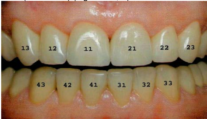
Fig.1 The formula of frontal teeth (according to WHO classification).

thresholds of teeth in female and male patients were demonstrated: in female it was lower than in male (about 31%) (Figure 2 A, B).