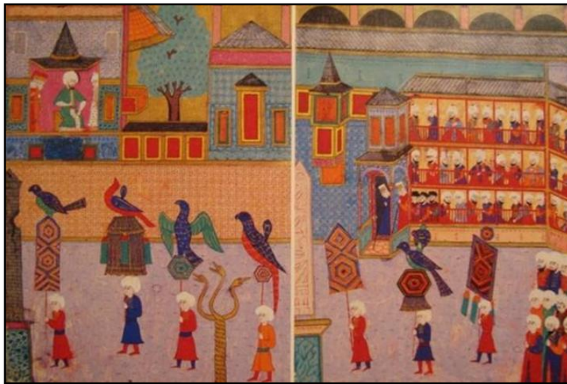
Picture 1. The Parade of the Waistcloth Producers, Regular Show, Sûrnâme-i Hümayûn, around 1587, TSM, H., 1344, y.338b-339a.

The most beautiful visual expressions of the existence and importance of the Ottoman Weaving Art are observed among the parades in circumcision ceremonies and in the parade of free-traders. The Sûrnâme reflects the longest circumcision ceremony of the Prince Mehmet, son of Sultan Murat III, which lasted for 52 days. In this ceremony, which turned to be the ceremony of the glory and power of the Ottoman State, all the free traders of İstanbul participated in the parade by acting their jobs. One of the scenes in the miniature belongs to the waistcloth producers in the parade of the commercial chambers. They carried the bird-shaped waistcloths during the parade in order to show their art. Some of the free traders carried the bathrobes they weaved with care on long sticks during the parades. This vivid and colorful vision turned into an unforgettable ceremony of the waistcloth producers. (Picture 1)