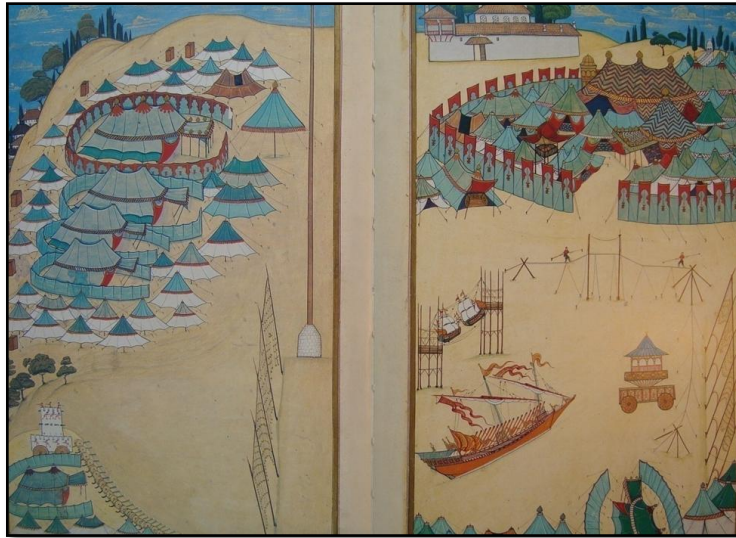
Picture 12. General View of the Arrow-field, Levni, Surname-i Vehbi, TSM, A. 3593 y. 10b-11a.

According to the sources, the decorated and ornamented tents belonged to the Sultan and his family. It is even understood that the use of the tents with red colors depended on certain rules by certain people. Just as in the architecture, the decorative elements are placed mainly in the inner areas of the tents. The decorations and ornaments outside the tents are rare. If there are ornaments, they are placed on the roofs of the tents.