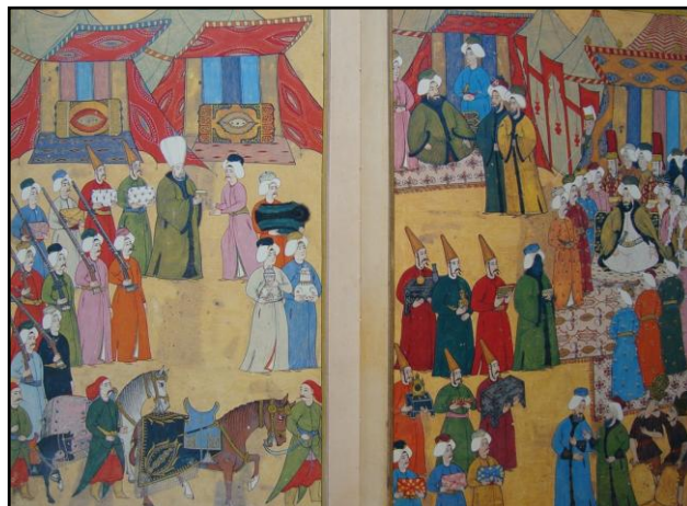
Picture 4. Grand Vizier Presenting his Gifts, Levni, Surname-i Vehbi, TSM, A.3593 y.26b-27a

In this Era, the importance given to the art of weaving and to the clothes made with fabrics is clearly illustrated in the miniatures with the presents given to the Ottoman Sultans. It is observed frequently that the Sultan is offered fabrics and kaftan together among other valuable objects as presents. Together with the cash payment to the artists like architects and muralists by the Palace, they are also given valuable fabrics or kaftans. This is documented in many written texts from the Era. In the heritage records (death registers) there are detailed records of fabrics, and clothes made from these fabrics left to the heirs. In the miniature, Sultan Ahmet III is seen as giving presents to the Grand Vizier in the ceremonies held in 1720. The knives with jewels held by the present-carriers, valuable fabrics wrapped in parcels, clothes with embroideries, belts, an overcoat with fur inside, rare furs and weavings are illustrated among the many other valuable presents. 3 (Picture 4)