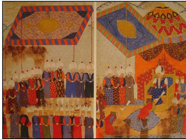
Picture 11. The Enthronement of Sultan Selim II, Nüzhetü'l-esrâr, p. 110b, 111a

enthronement ceremony. No elements for mourning are visible except a black osprey placed on the white quilted turban. The miniature is depicting a full ceremony with its powerful colors and explicit expression. The State Tent full of red color and the canopies under which the viziers and statesmen stand constitute the rich décor of the scene and show the glory of the ceremony. (Picture 11)