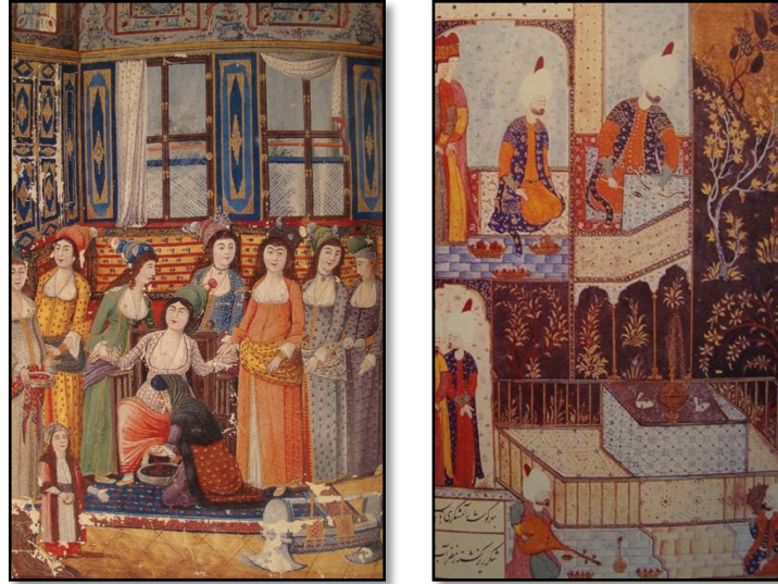
Picture 7. (Left) The Birth Scene , Enderuni Fazıl, Hubanname- Zenanname , İÜK, T5502.

It is observed that, in illustrating the miniatures, sometimes the muralists had used the clothes of the people as the tools to convey the emotions and thoughts. The muralist wanted to show that Prince Mustafa resembled his father in the miniature which depicted the visit of Prince Mustafa paid to his father, Suleiman the Magnificent, who was beloved by his father very much. 6 The dress of the prince being all the same in the miniature must be due to the expectation that the subsequent Sultan will be Prince Mustafa after Suleiman the Magnificent. 7 (Picture 8)