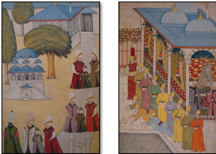
Picture 5. (Left) Bringing the Princes to the Circumcision Room, Levni, Surname-i Vehbi, TSMK, A3593, y. 173b

The birth of the sons of the Sultans is called as “ the imperial birth ”. The dresses and jewels were prepared beforehand for the baby and the mother. The birth scene in the miniature is depicted in detail. It is understood from the documents that have reached today that the birth rooms were renewed and redecorated in each birth. It is also understood that -among the other belongings- the beddings, which were in the room in which the daughter of Sultan Mahmud II, Saliha Sultan was born, were ornamented with silver thread on seraser cloth and were enriched with pearls and sequins. One of the most important elements in the birth room is, without doubt, the cradle of the baby. The cloth and quilt of the cradle, and the lines that prevented the baby from falling down were made from ornamented cloth. 5 (Picture7)