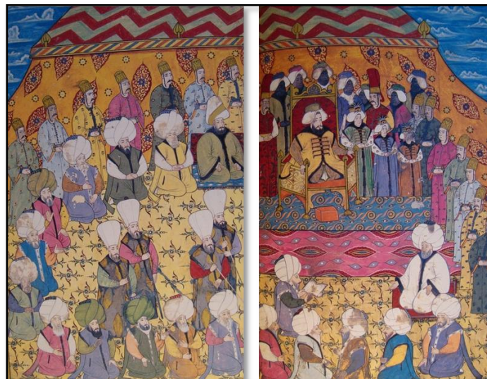
Picture 13. The Admittance of Sultan Mehmed III in His Imperial Tent, Şehname-i Sultan Mehmed III. 1586, TSM, H, I 609, 26b-27a.

In the miniature depicting Sultan Mehmed II as admitting the Magyar Envoy in his Imperial Tent, a good example is provided showing that the glory of the palace life is also reflected outside the palace as well. This work of art is illustrated in accordance with the written texts and is among the miniatures that show the tent culture and the dressing cultural with full aesthetics concerns and wealth.