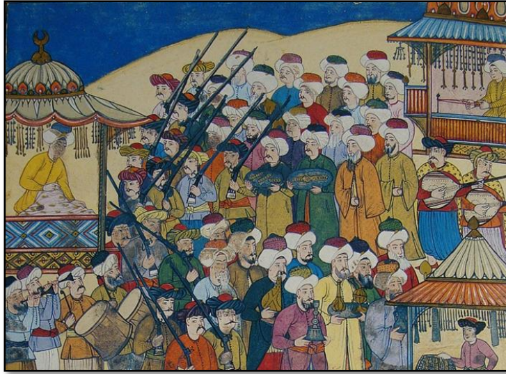
Picture 3. The Group of Free Traders: the Copper Traders, the Jewelers, the Tailors and the Silk Weavers, Levni, Surname-i Vehbi, TSM, A. 3593 y.121a (detail).

In this Era, the importance given to the art of weaving and to the clothes made with fabrics is clearly illustrated in the miniatures with the presents given to the Ottoman Sultans. It is observed frequently that the Sultan is offered fabrics and kaftan together among other valuable objects as presents. Together with the cash payment to the artists like architects and muralists by the Palace, they are also given valuable fabrics or kaftans. This is documented in many written texts from the Era. In the heritage records (death registers) there are detailed records of fabrics, and clothes made from these fabrics left to the heirs. In the miniature, Sultan Ahmet III is seen as giving presents to the Grand Vizier in the ceremonies held in 1720. The knives with jewels held by the present-carriers, valuable fabrics wrapped in parcels, clothes with embroideries, belts, an overcoat with fur inside, rare furs and weavings are illustrated among the many other valuable presents. 3 (Picture 4)