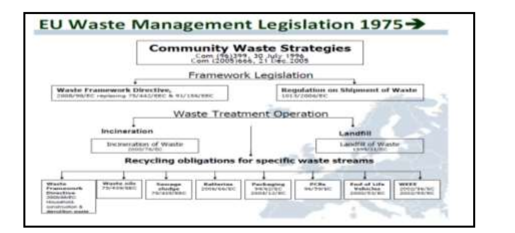
Figure 1. EU waste management legislation outlook<sup>8</sup>

-Introduction of a huge range of recycling initiatives and targets in different directives (Figure 1)