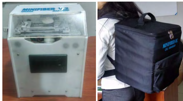
Figure 1. Portable Fiber Tester working at farm condition. The image of left side shows the small dimensions. The image of right side shows the portability

the dimension of 21.5 cm x 2.15cm x 27.5 cm. The PFT operates using digital image capture and its own analytical program, which measures the fiber diameter values and captures digital data of per sample within 45 seconds. Information about measures (AFD, SDAFD, number of measures, temperature, environmental humidity and other information) are saved in an Excel file (Figure 1).