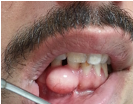
Figure 1. Intra-oral appearance of the lesion.

A 24-year-old male patient presented to our clinic with swelling in the anterior surface of lower jaw. It has been two years after the onset of his initial symptoms. The patient did not report pain, but he was suffering from cosmetic problems associated with the swelling. His medical history did not reveal any systemic disease or regular use of medication. During intra-oral examination, a round and immobile nodule was observed on the right anterior surface of the mandible adjacent to teeth number 41 and 42 (FDI two-digit tooth numbering system) (Figure 1).