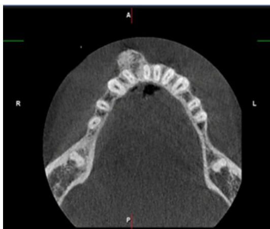
Figure 4. The axial images obtained from the cone beam computed tomography shows the dense appearance of the lesion.