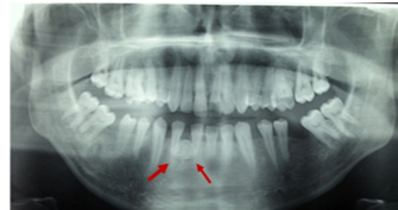
Figure 3. Panoramic radiograph revealing the radioopaque lesion.

Panoramic radiography showed a radioopaque lesion in the region that corresponds to the swollen area (Figure 3).