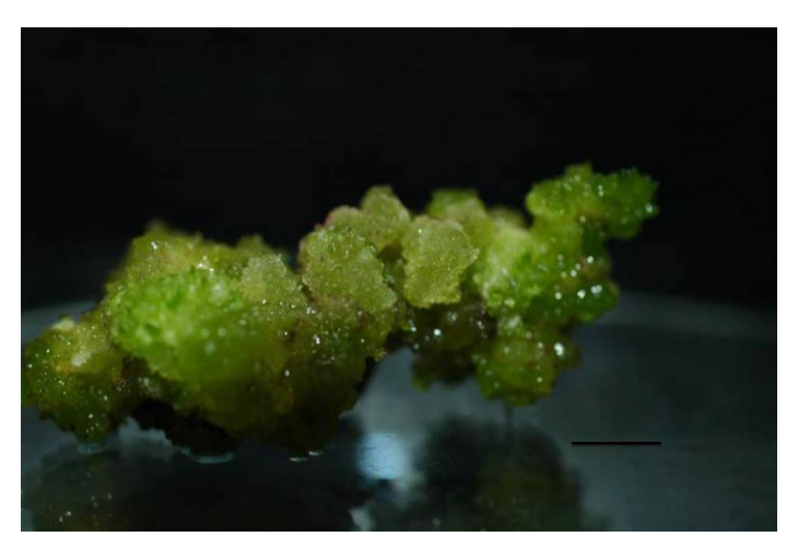
Figure 4. Callus formation on MS medium containing 1 mgL<sup>-1</sup> TDZ after 4 weeks of incubation (Bar: 1 cm)

When the media that form callus was evaluated, the highest callus induction frequency was observed in explants cultivated on MS culture medium with 4 \text{ mgL}^{-1} \text{ BA} + 0.2 \text{ mgL}^{-1} \text{ NAA} . (Table 3).