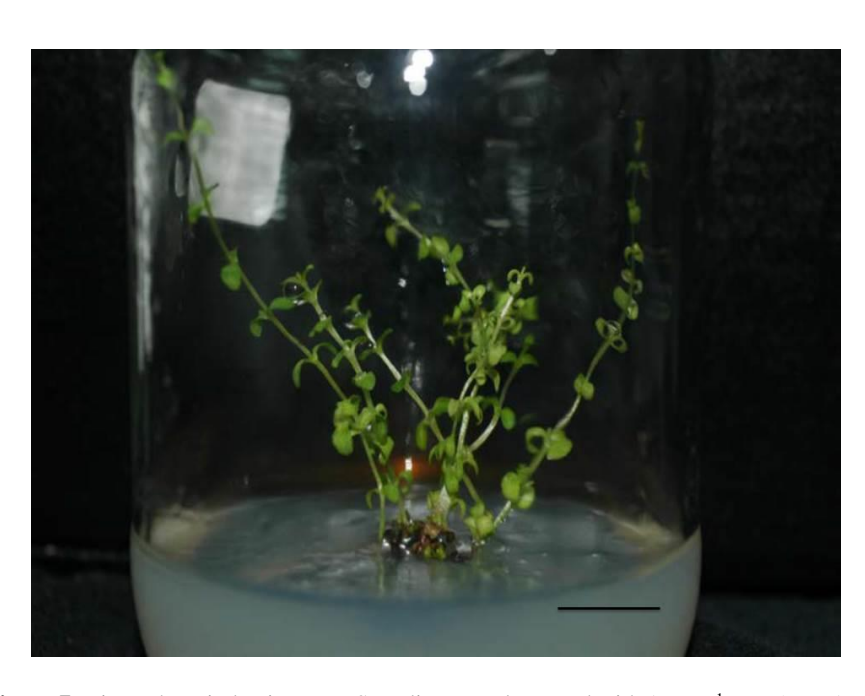
Figure 7. Direct shoot induction on MS medium supplemented with 1 mgL^{-1} KIN (Bar: 1 cm)