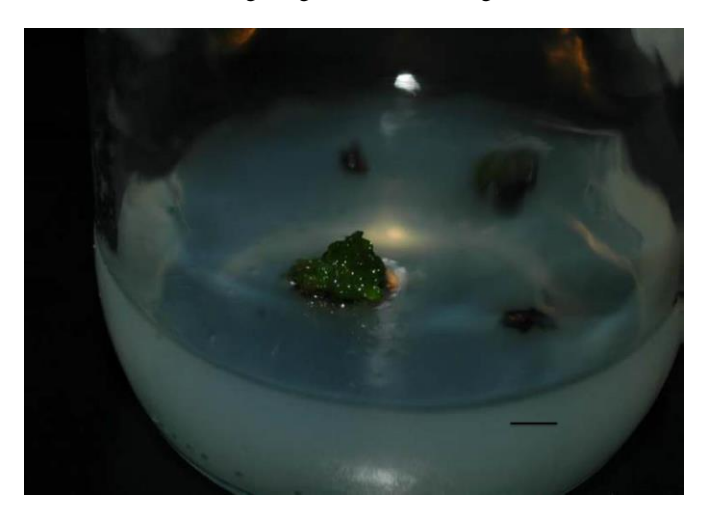
Figure 3. Callus induction on MS medium containing 2 mgL<sup>-1</sup> KIN and 0.2 mgL<sup>-1</sup> NAA after 4 weeks of incubation (Bar: 0.5 cm)

Callus induction was observed in the explants which were on MS medium with TDZ was added in different concentrations (Table 2). In explants cultured on medium with TDZ, callus induction frequency is observed to increase based on the TDZ concentration. 1 mgL<sup>-1</sup> TDZ has the highest callus induction