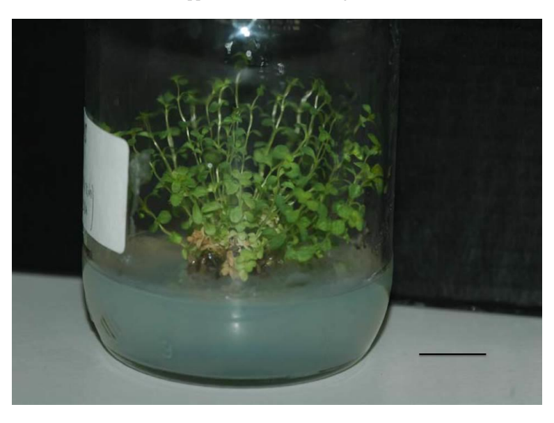
Figure 6. Adventitious shoots on without plant growth regulator MS medium after 12 weeks of incubation (Bar: 1 cm)