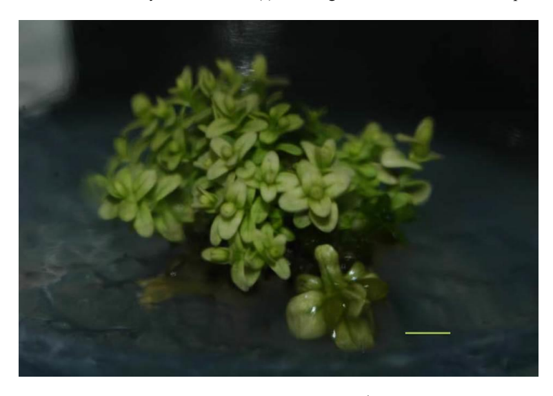
Figure 5. Adventitious shoot on MS medium supplemented with 0.5 mgL<sup>-1</sup> KIN after 8 weeks of incubation (Bar: 0.2 cm)