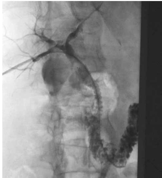
Figure-2b. Drainage of contrast material through the stent was immediate