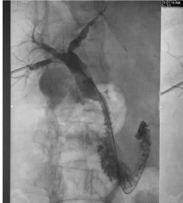
Figure-2a. An internal stent (arrow) was inserted over a guide wire through the previously inserted percutaneous trans-abdominal catheter

Usually the symptoms of choledochal cysts are caused by complications of the primary illness such as ascending cholangitis, pancreatitis, stone formation, jaundice, spontaneous rupture of cyst's content and ensuing bile