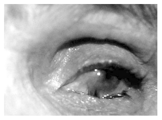
Figure 4a. Preoperative view of a patient who underwent eyelid retractor repair and horizontal eyelid shortening.