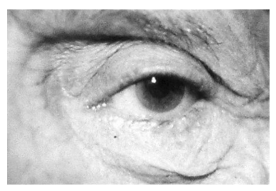
Figure 2a. Preoperative view of a patient who underwent eyelid retractor repair.