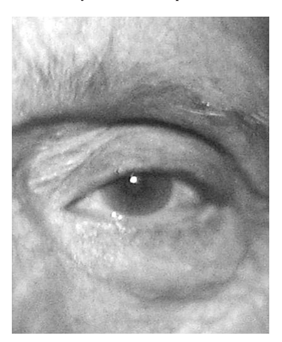
Figure 2b . Postoperative view of the patient 6 years after the operation

Eyelid retractor repair + horizontal eyelid shortening: Blepharoplasty incision was made 2-3 mm below the eyelashes under local anesthesia. After dissecting away the skin and orbicular muscle and uncovering the eyelid retractors, a vertical cut from the edge to the base of tarsus was made on the 1/3 outer part of lower eyelid. Depending on the laxity, a 2-5 mm pentagonal tissue that included all layers of skin, muscle and tarsus was removed. To bring the eyelids toget-