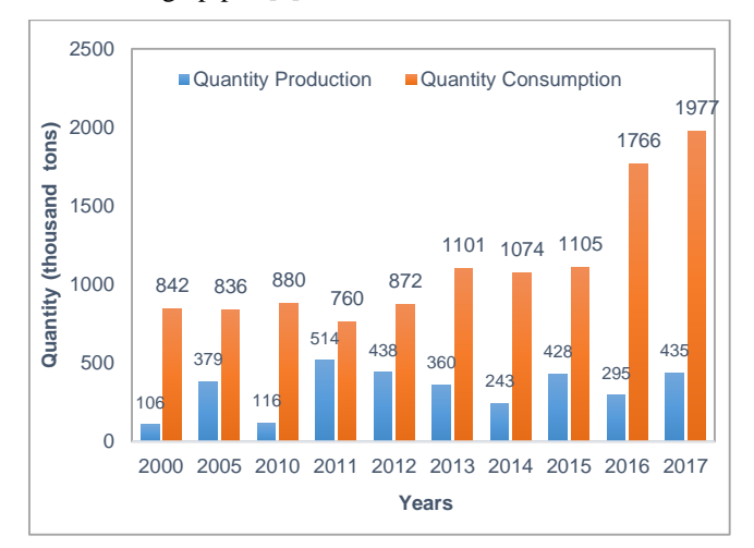
Figure 2 Urea quantities used and produced in Turkey [17].